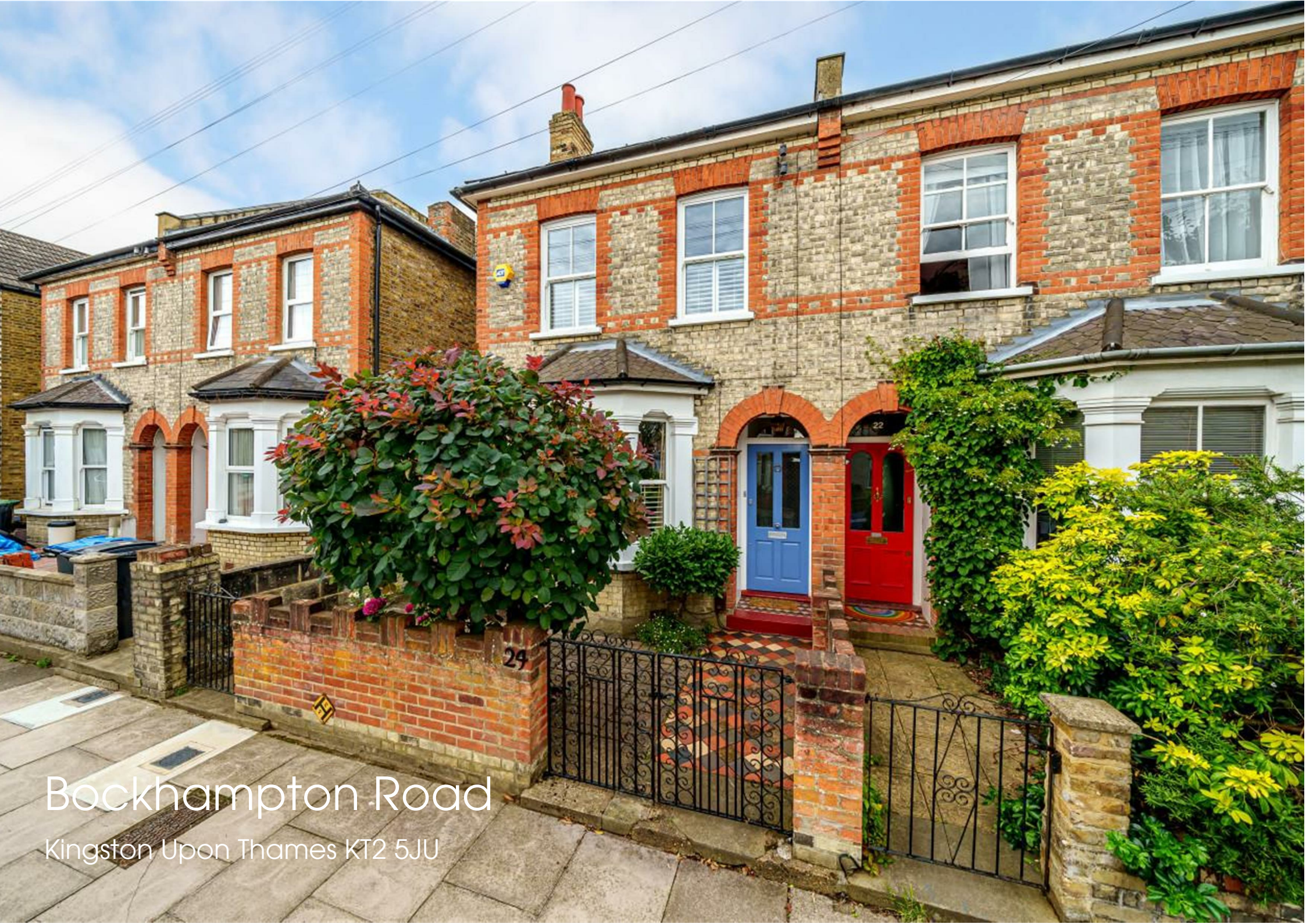
Bockhampton Road Kingston Upon Thames KT2 5JU

34 Richmond Road Kingston upon Thames Surrey KT2 5ED www.gibsonlane.co.uk Tel: 020 8546 5444